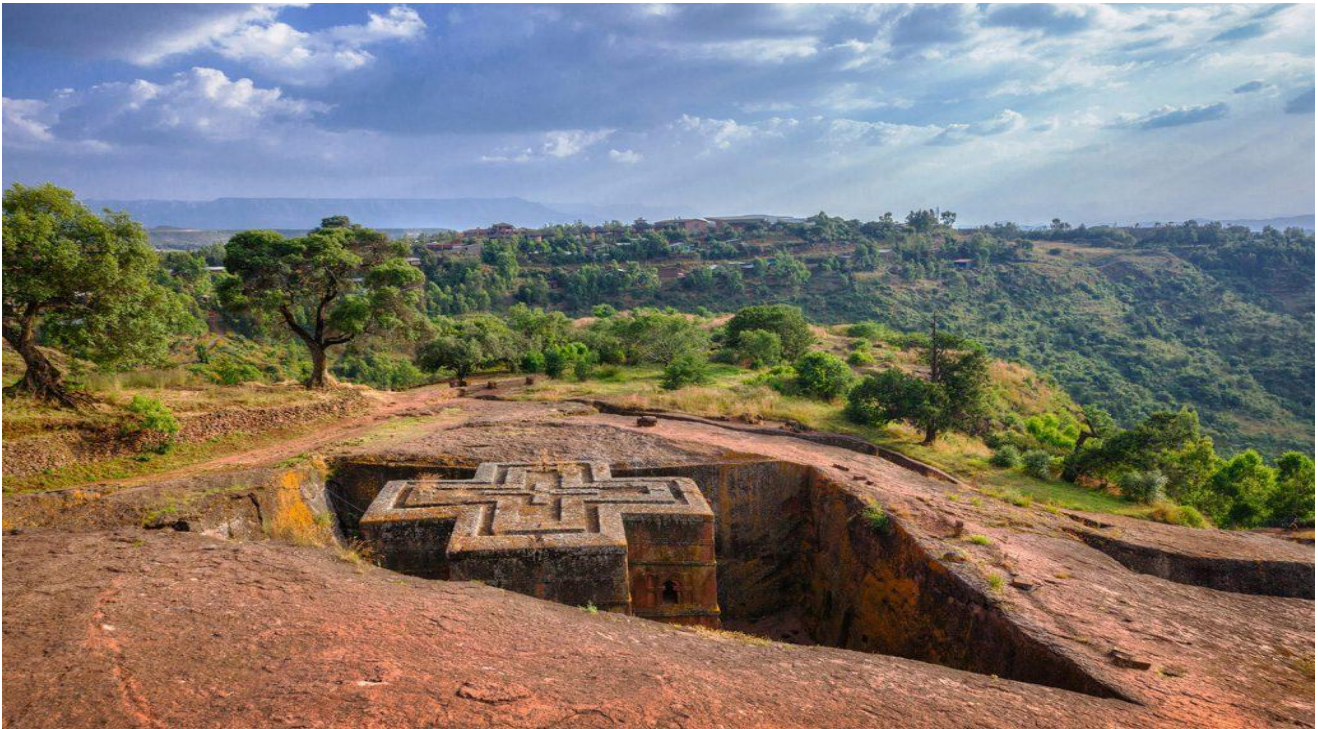
To view of the church of Biete Ghiorgis ( House of St. George ),

Nowhere does the spirituality of the church's followers echo louder than in Lalibela. The town is brimming with devotion; throughout the churches' compound, you'll find worshipers leaning against the structures, kissing the age-old rock walls, praying quietly or reading a religious text.