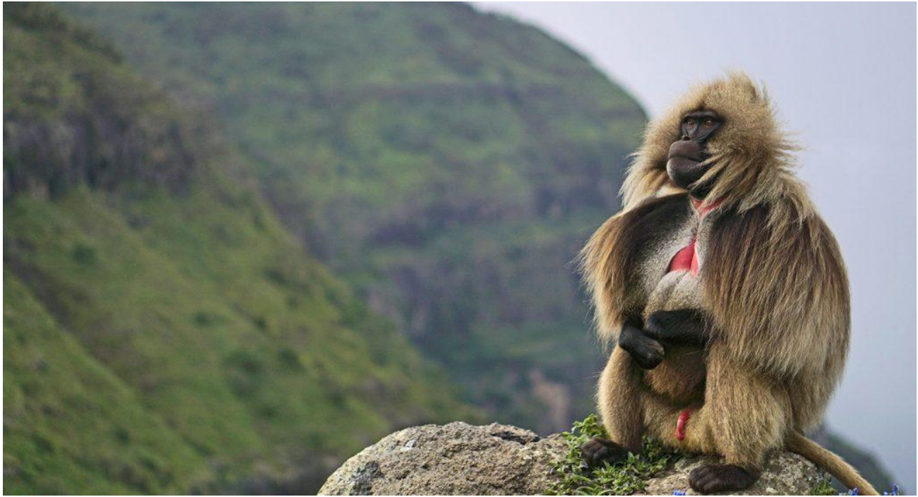
Gelada in Simien Mountains

The Gelada baboon, also called ' The Bleeding Heart Baboon ', a result of the distinctive, bright red, heart-shaped patch on its chest. The Gelada is endemic to Ethiopia, found on most of the highland plateaus of the Simien Mountains, inside and outside the Park, and their total number has been estimated at more than 3000 animals. The gelada social system consists of a hierarchy of Social groupings. A basic group is a reproductive unit of the breeding male of 1 to 44) and female of 1 to 10 and their depending young.