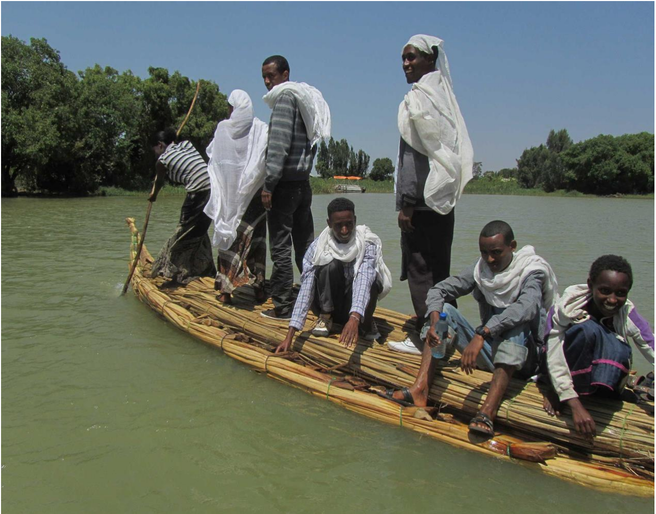
Traditional Fishing on Lake Tana ,Bahir dar

On your arrival at Bahir Dar airport, you will meet our tour representative and you will transfer to your hotel for check in to refresh and then you will transfer to Lake Tana and embark on a private boat trip for a day of visit to some of the many ancient monasteries hidden on the shores and islands of Lake Tana.