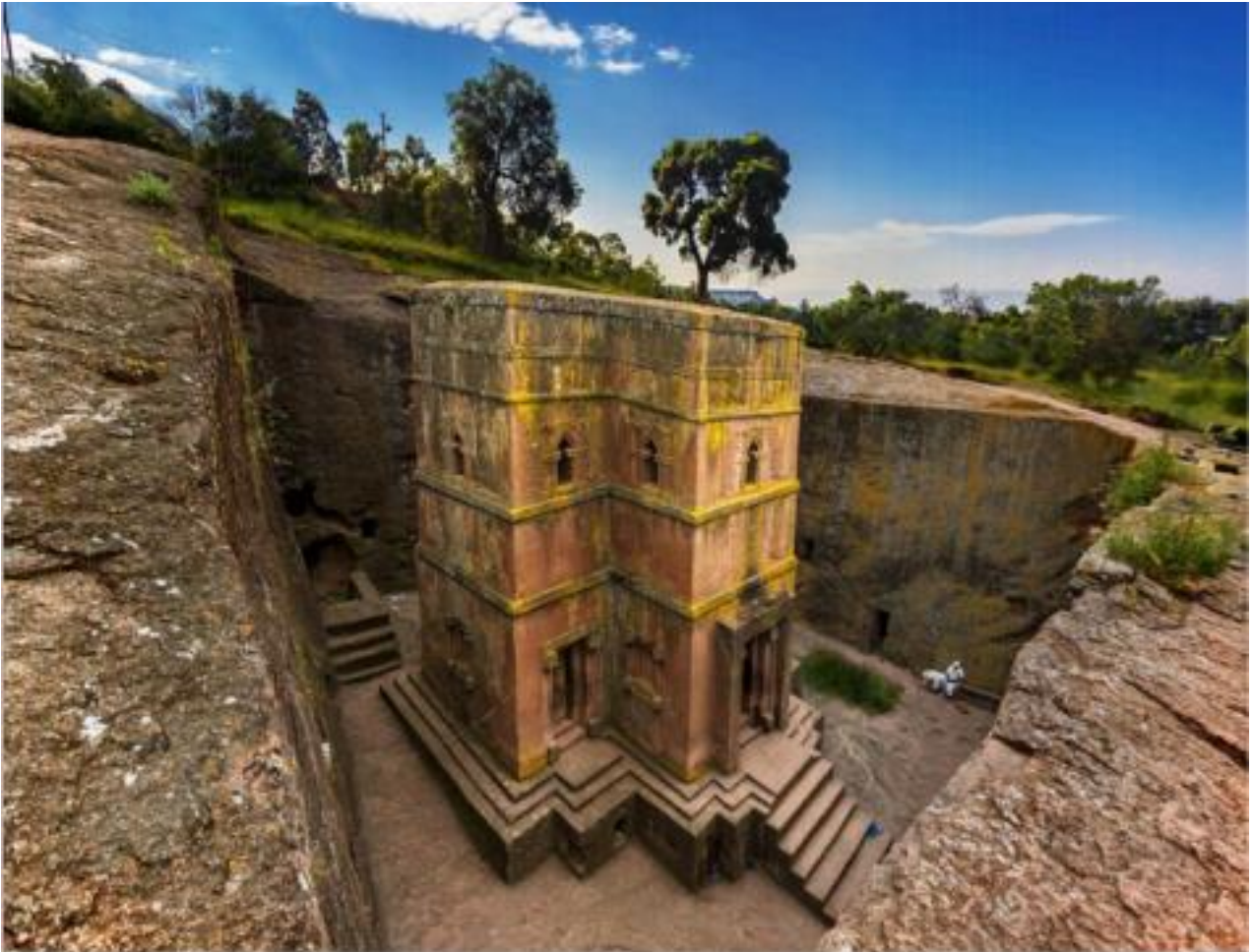
Church Service at Lalibela (House of St. George)

Among churches of this group, Bete Medahine Alem (house of the redeemer) is the largest with 5 aisles, 72 pillars, a vaulted dome and moulding decoration. Bete Mariam (house of st. Marry) is the most decorated among the rock-hewn churches. After the visit of the first group of churches you drive back to the hotel to stay over.