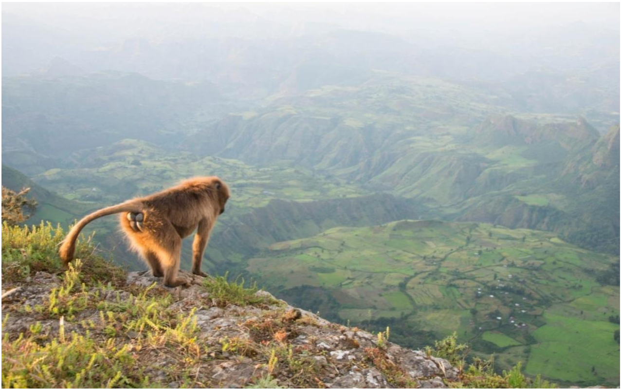
The Landscape and the Gelada monkeys

whilst and enjoying the Lammergeyer vultures gilding over the escarpment.