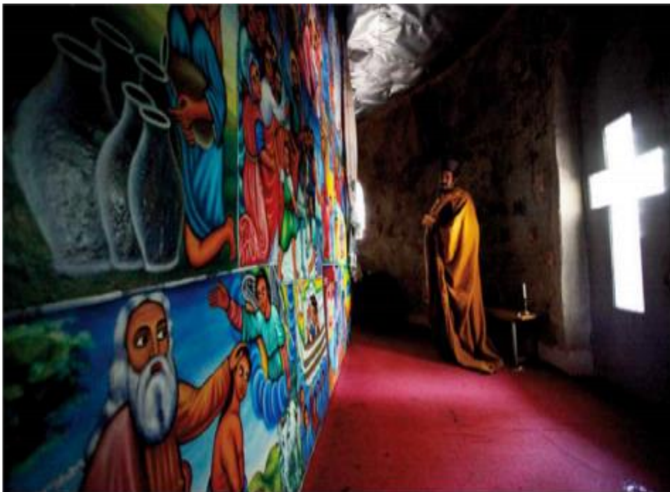
Painting inside the monasteries in the island of Lake Tana

Then you will also visit the source of the Blue Nile River, where it departs Lake Tana for its long journey to the Mediterranean Sea. There are hippos that can be seen in the shallow waters. In the late afternoon while back from your visit you may have the chance to see hippos on the lake. When you go back to the city, check in to your hotel and out for a city tour if time permits.