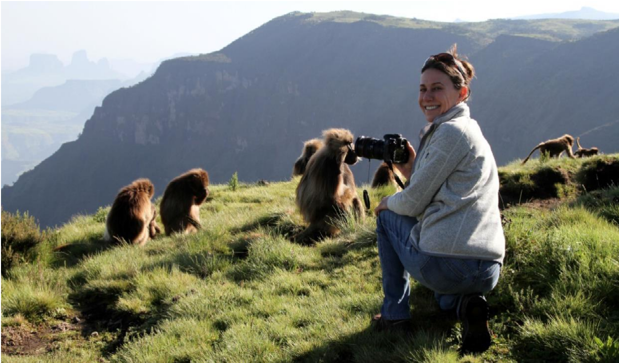
Close look of Gelada monkeys at Simien Mountains