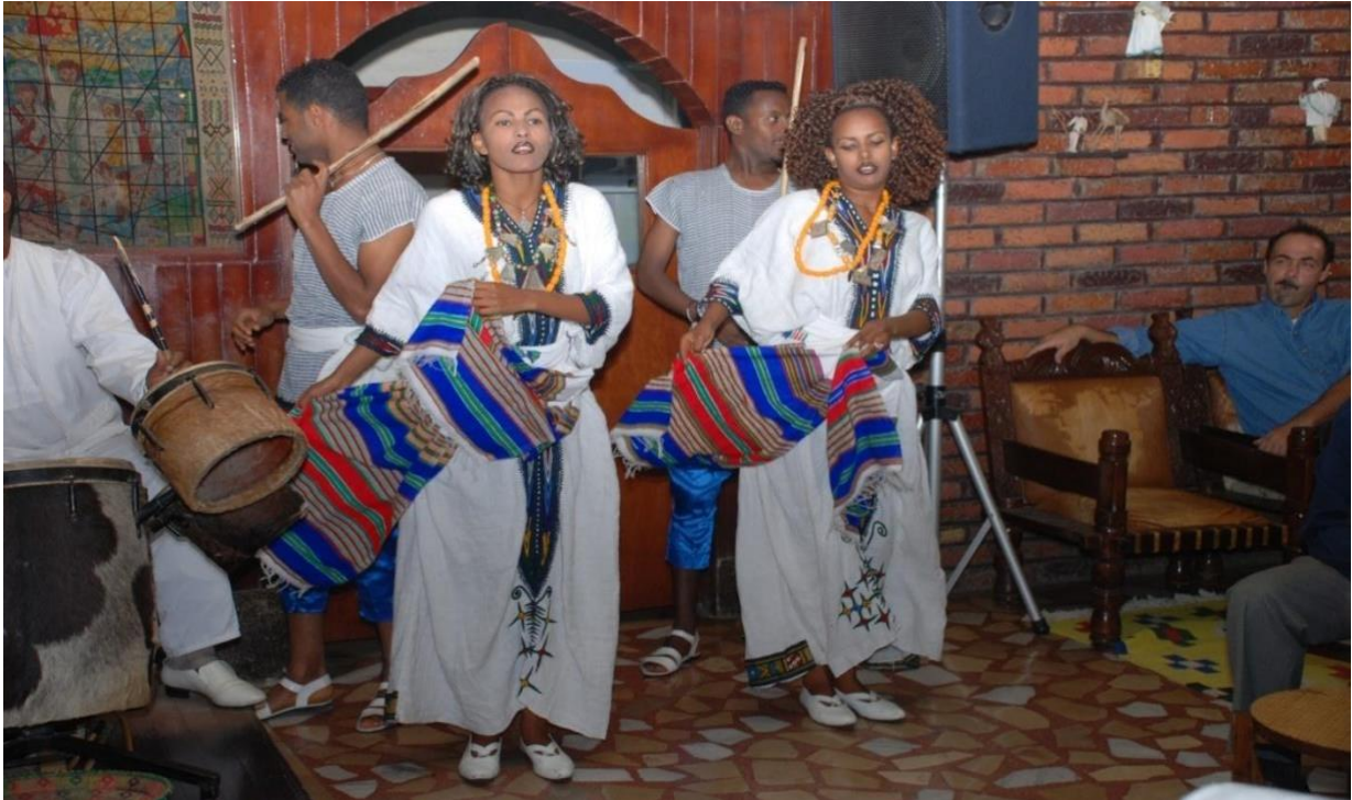
Live Folklore Dance

In the morning, after a relaxed breakfast transfer to Lalibela airport for a flight to Addis Ababa and you will transfer to your hotel for day use.