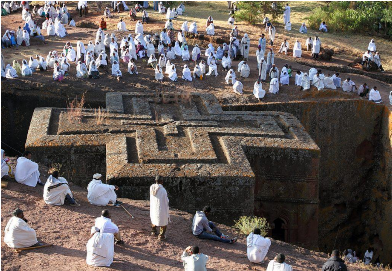
Spiritual Service at the church of Biete Ghiorgis (House of St. George)

The churches were not constructed in a traditional way but rather were hewn from the living rock of monolithic blocks. These blocks were further chiselled out, forming doors, windows, columns, various floors, roofs etc. This gigantic work was further completed with an extensive system of drainage ditches, trenches and ceremonial passages, some with openings to hermit caves and catacombs.