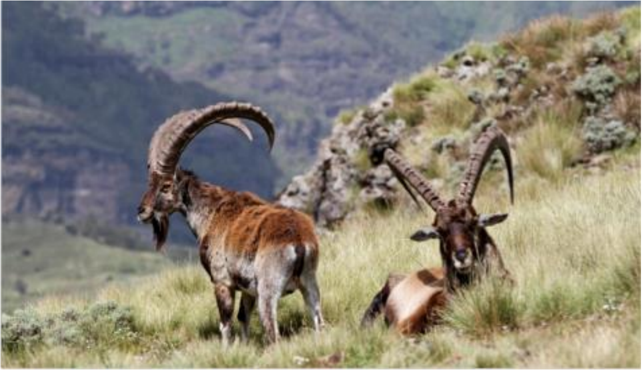
Walia Ibex in Simien Mountains