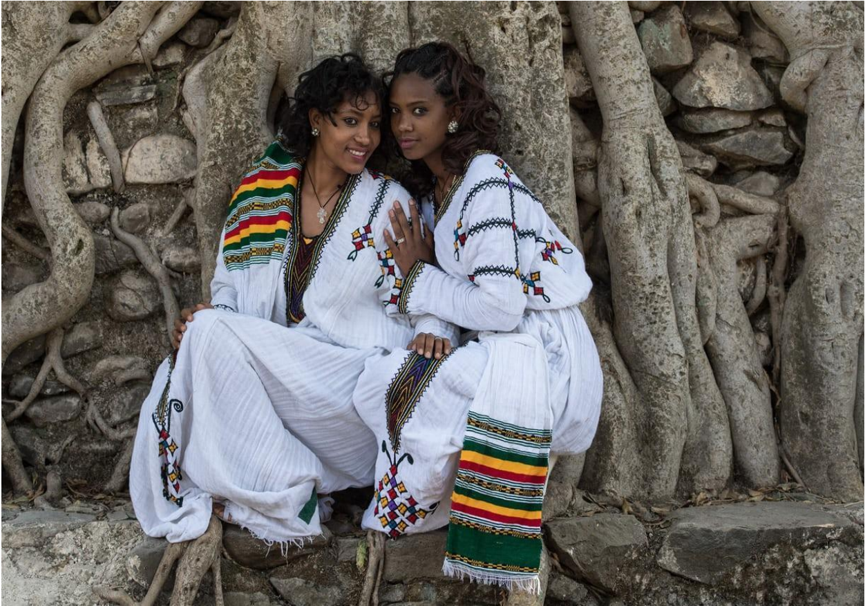
Girls in traditional Attire in Amhara Region

Then you will drive to Bezawit Hilltop. It is one of the most popular sightseeing places in Bahir Dar. On the very top of the hills, the magnificent palace of the late Emperor Haile Selassie can be found. After driving to Bezawit hilltop, you will look over the Blue Nile River flowing out of the lake, watching birds and the great view of the sunset with Lake Tana, then drive back to your resort.