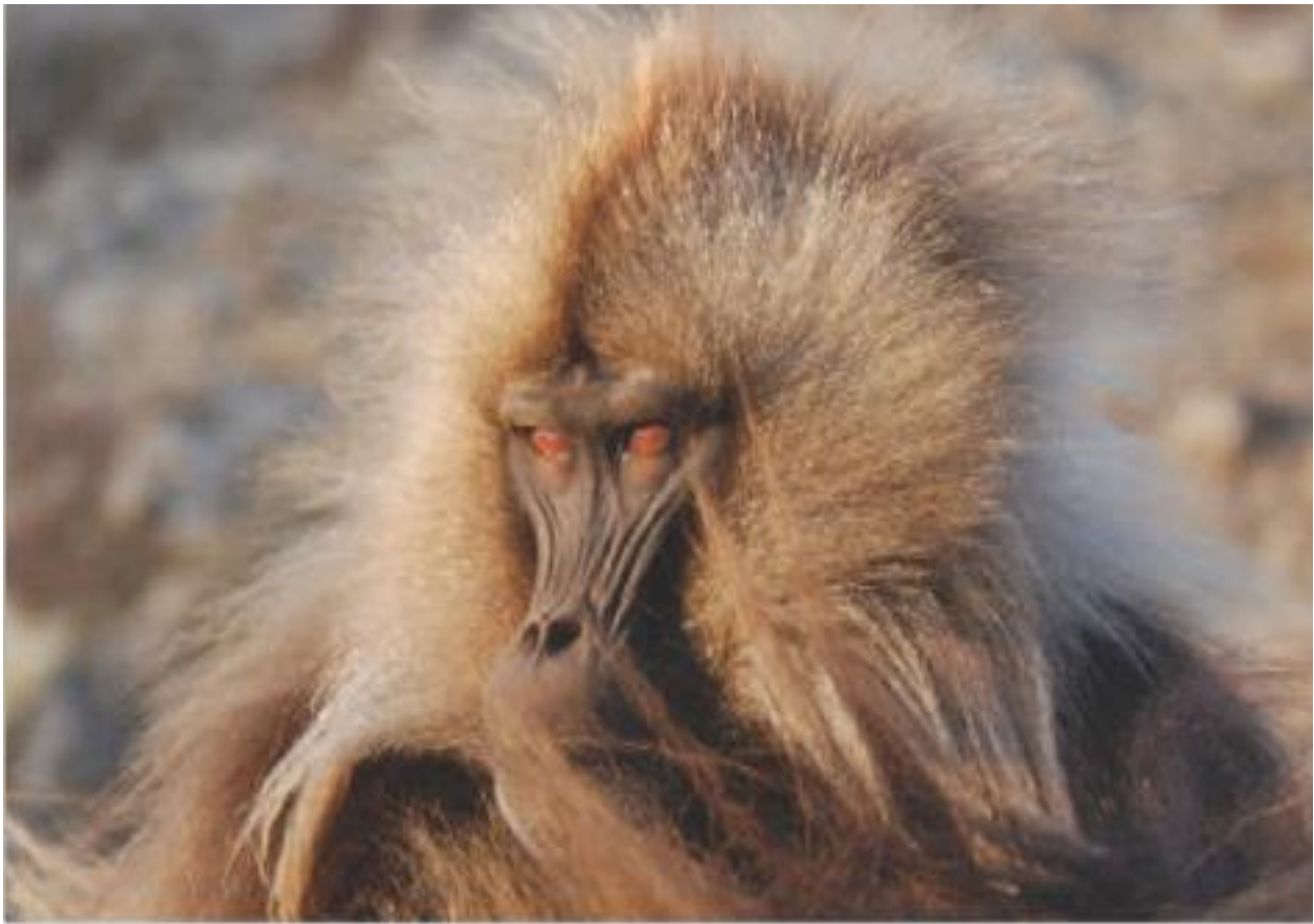
Gelada Monkey in Simien Mountains

Ras Dashen 4543 m (4,900feet) above sea level, making it the fourth highest mountain in Africa. The Simien Mountains were recognised by UNESCO as a world heritage site and famous for being home to 22 large, 13 small mammals and the three of which, the Walia Ibex, the Gelada monkeys and Ethiopia Wolves are some indigenous mammals in the mountains.