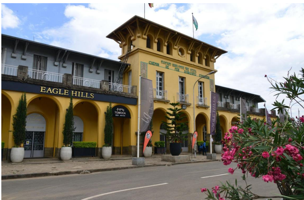
Old Building of Ethio -Djibouti railway in Addis Ababa

Arrive at Bole International Airport terminal 02 in Addis Ababa and you will be greeted and met by an Ethiopian Adventure tour representative and transferred to your hotel for Check-in. After some rest and lunch in your hotel, you will have a city tour around the fourth highest capital in the world, Addis Ababa. The tour includes the visit of the National Museum of Ethiopia, one of the most important collections in sub-Saharan museums in Africa, where the 3.2 million years old fossil called Lucy is found and a visit to Emperor Haile Selassie's former palace – a must-see sight while you are in Ethiopia.