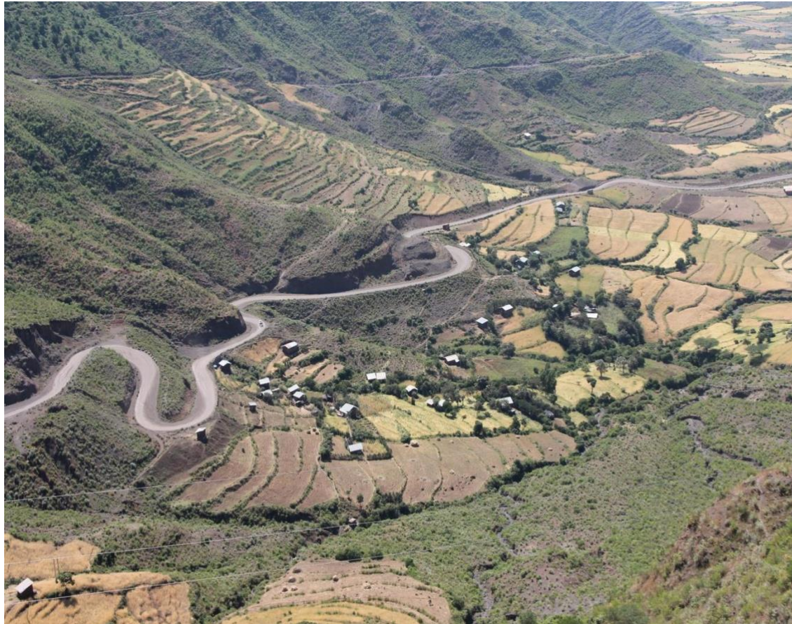
The rural landscape of Lalibela

On the way up; you'll pass through farming fields that the villagers use for growing plants and vegetables. When you get there, the priest will welcome you and show you the sacred items held in the monastery, including an illustrated Bible. After a visit to the church on the way back, you will have local community house's visits and you will be back to the centre of the town for lunch at Ben Abeba restaurant with a spectacular panoramic view of the surrounding region.