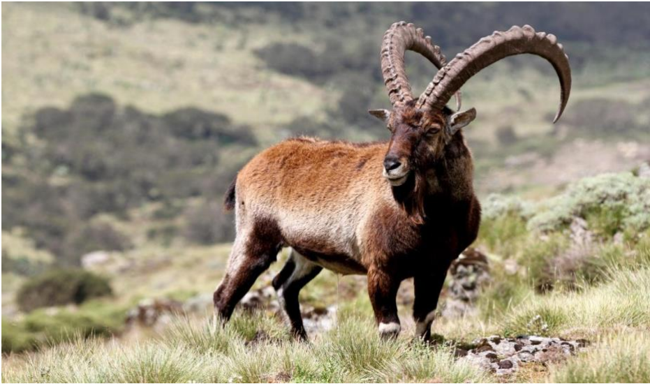
Walia ibexin Simien Mountains

The Walya ibex has become a national symbol, it is endemic to the Simien Mountains, and is one of the most endangered mammal species in the world. Walya ibex live on the steep slopes and grassy ledges of the escarpment towards the eastern parts of the Park and beyond.