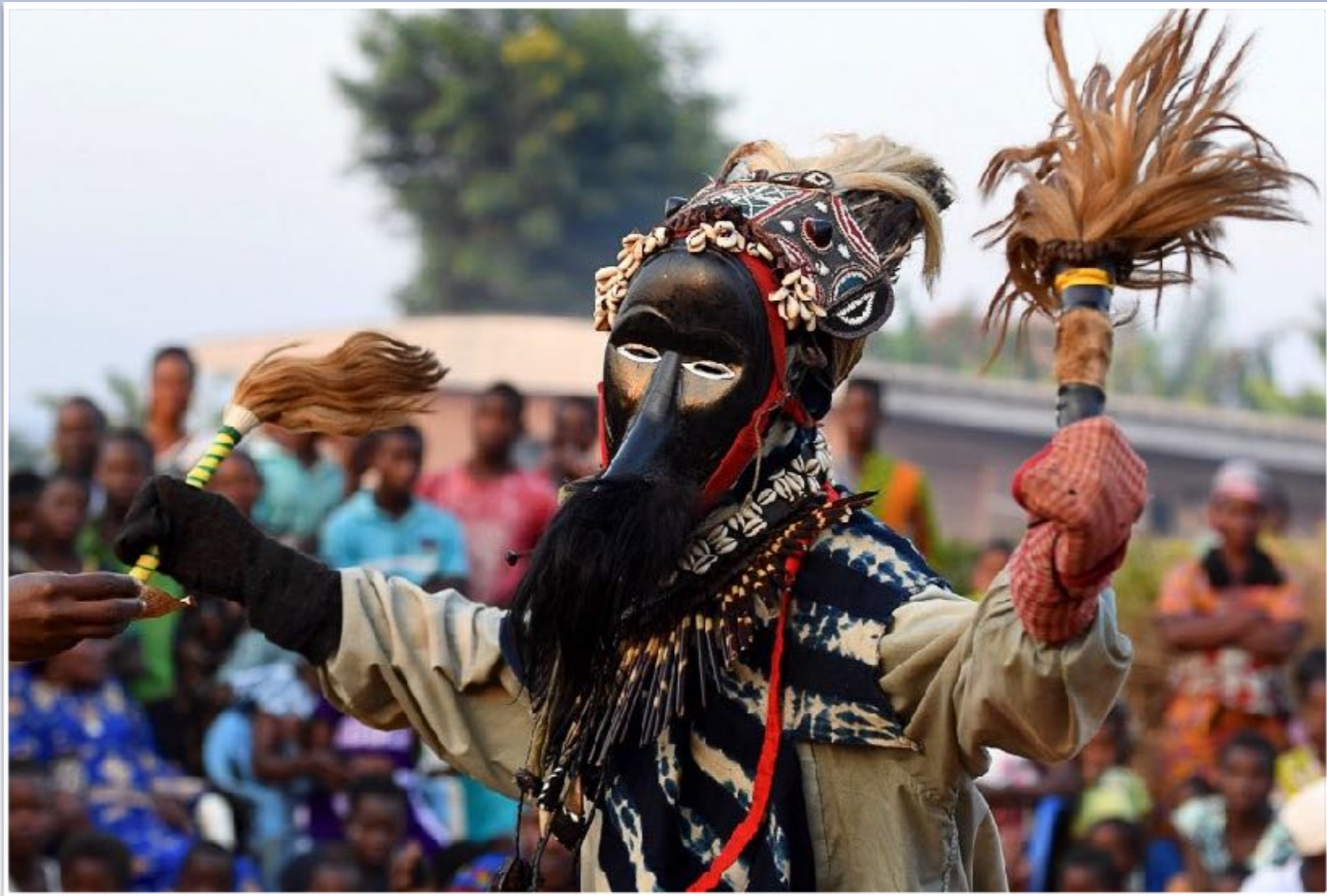
The echoes of tam-tams and the shouts of the initiated tell the masks it is time to leave the sacred forest