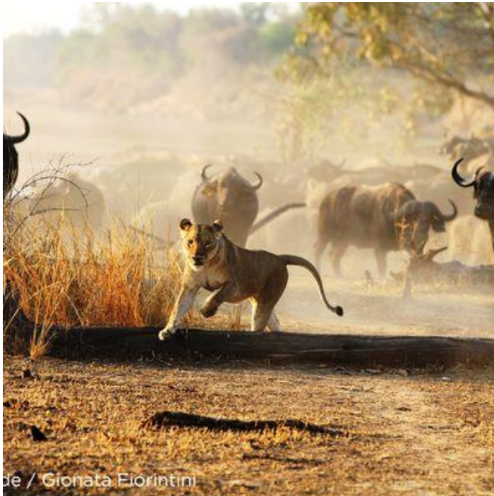
de / Gionata Fiorintini